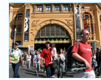
Figure 6: Pedestrian Flow