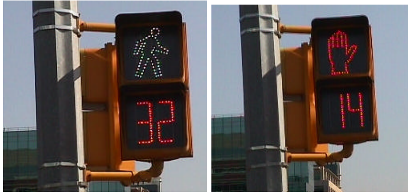
Figure 7: Pair Looks of a Countdown Signal