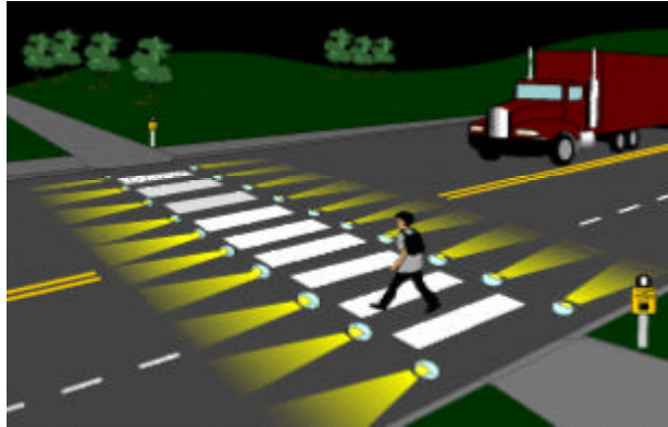
Figure 6: Illustration of a Crosswalk with In – Pavement Flashing Lights

required for a pedestrian to safely cross the street. If installed in conjunction with the means to detect the presence of pedestrians while in the crosswalk, the crossing interval can be extended, in which case the lights would continue to flash and allow slower pedestrians to safely cross. One well-known example of such a system is the LightGuard System , where the flashing lights are activated by passive pedestrian detectors.