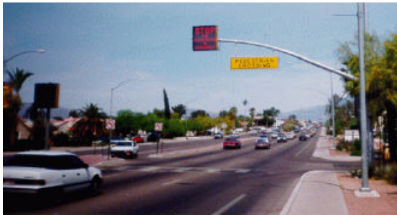
Figure 2: Tucson Overhead Pedestrian Regulatory Sign (9)