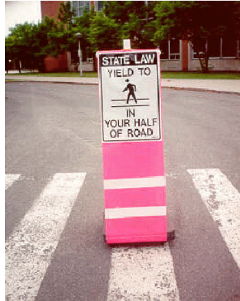
Figure 1: New York Pedestrian Safety Cone Application (9)