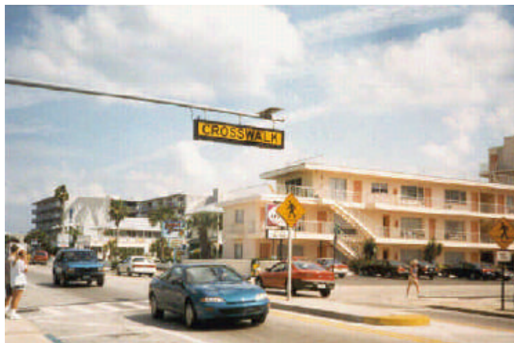
Figure 3: Illuminated Overhead Crosswalk Sign in Clearwater, Florida (9)

the percentage of pedestrians for whom motorists yield (from 45.5% before to 52.1% after the sign installation) that was significant at the 0.001 level. Moreover, fewer pedestrians ran, aborted, or hesitated after the overhead crosswalk sign was installed in Seattle (43.1% after versus 58.2% before). Another study that assessed illuminated overhead pedestrian crosswalk signs in Florida reveal that daytime drivers were 30 to 40 percent more likely to yield to pedestrians at the locations with the devices, compared with locations without the