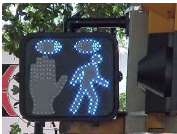
Figure 8: A Pedestrian Signal with Animated Eyes

The animated eyes display uses a light-emitting-diode (LED) pedestrian signal head and adds animated eyes that scan from side to side. The device uses narrow (8 degree) field of view LEDs on a black background. The display is highly visible to pedestrians while restricting signal visibility to motorists (15).